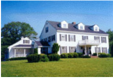
Single Family Residence

Challenging, unique and routine. In addition to unique assignments, we have experience with the following: