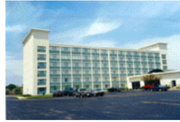
Hotel and Restaurant