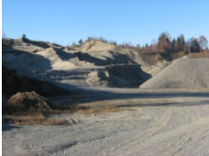
Sand & Gravel