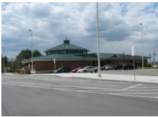
Turnpike Visitor Center