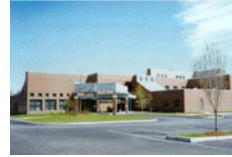
Surgery and Rehab Clinic

Assignments are completed in New England. Cooperative relationships are maintained with real estate appraisers, counselors, and related professionals across markets. Collaboration is offered for large or multi-disciplinary assignments.