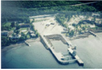
International Ferry Terminal